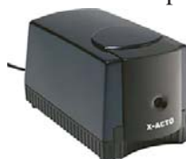
KCDA No. 99566 Not for use with color pencils