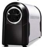
KCDA No. 99589 Colored pencil compatible

The description as listed in the pictures for sharpeners F and G on page 343 are reversed. KCDA No. 99589 should read "Colored pencil compatible" and KCDA No. 99566 should read "Not for use with color pencils".