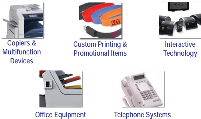
Copiers & Multifunction Devices