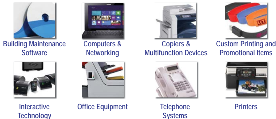
Building Maintenance Software